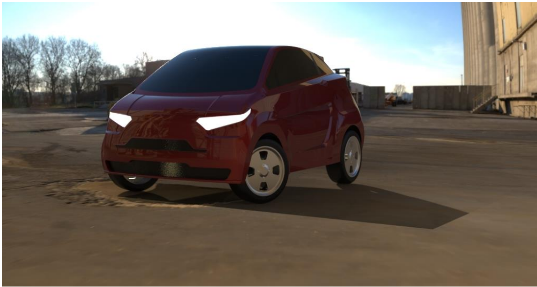
Figure 3 CAD model