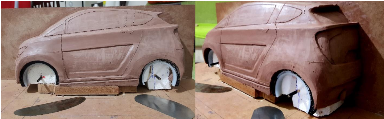
Figure 2 clay model